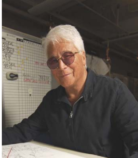
Good Horse Nation